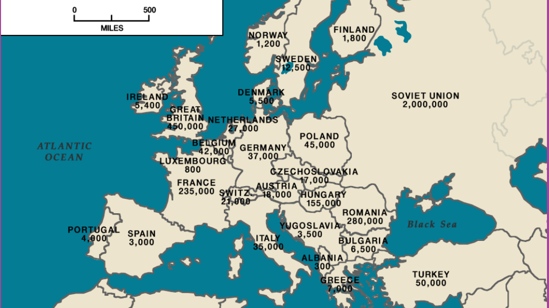
USHMM map of European Jewish communities c. 1950 depicting the aftermath of the Holocaust.